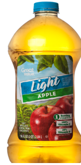
Fruit juices you can see through, such as apple or white grape