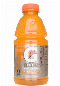
Gatorade, other sports drinks, or other drink mixes like Kool-Aid