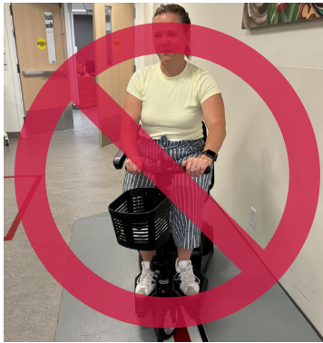
Avoid driving at an angle. Drive in a straight line across side slopes.

If you are going over a side slope, drive as straight as possible across the slope. Avoid driving at an angle.