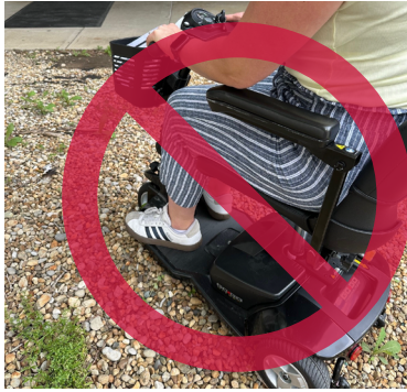
Avoid uneven surfaces.

Avoid uneven surfaces, such as gravel pathways and potholes, as they can cause you to tip from your scooter. Also, avoid icy and wet surfaces, and puddles.