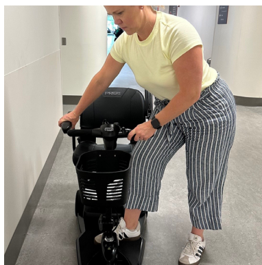
Grip the handlebars, as you slide onto or off of the seat.

Before transferring to or from your scooter, turn off the power. It may also be helpful to turn the seat of the scooter to make transferring easier.