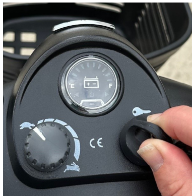
Turn off your scooter.

When reaching for an object outside of your center of gravity, get close to the object, turn off your scooter and place your foot on the ground to make yourself more stable before reaching. Use a reacher to pick up and grab objects as needed.