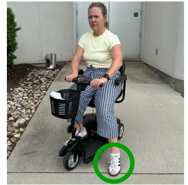
If needed, use your feet to prevent tipping.