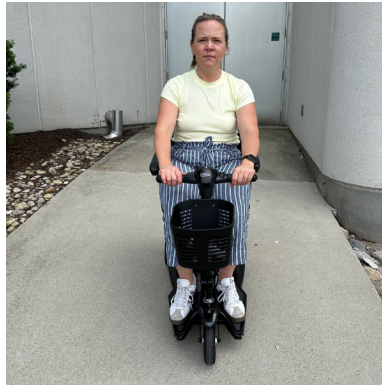
Drive down the center of the ramp slowly.

Go up and down ramps slowly. Keep your wheels away from the edges of the ramp. If the wheel falls off the edge of the ramp, this may cause you to fall.