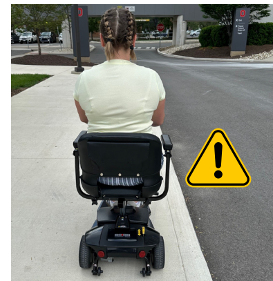
Be aware of curbs.