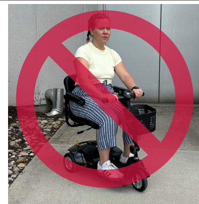
Avoid driving at an angle.