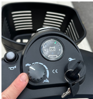
Go slow when turning.

When making turns, go slow. Scooters can tip over if you try to make a turn too quickly. Also, be aware what is around you, including curbs and pavement edge drop-offs.