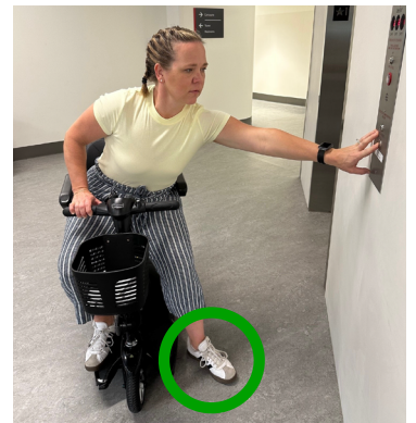
Place your foot on the ground to make yourself more stable before reaching.