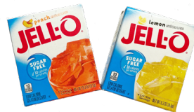
Jell-O or other gelatin, without fruit ( no red or purple)