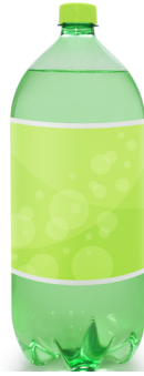
Ginger ale or lemon-lime soda