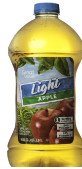
Fruit juices you can see through, such as apple or white grape