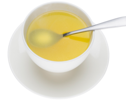
Clear broth or bouillon