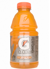
Gatorade, other sports drinks, or other drink mixes like Kool-Aid