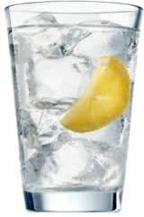
Water, flavored water, or ice chips