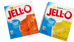
Jell-O or other gelatin, without fruit ( no red or purple)