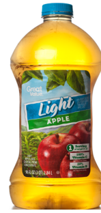
Fruit juices you can see through, such as apple or white grape