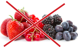
Fruit with skin or seeds