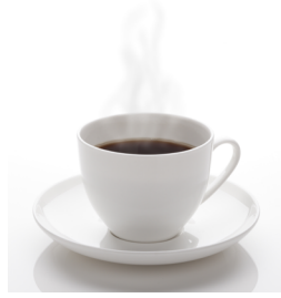
Coffee or tea with no milk or cream