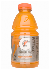
Gatorade, other sports drinks, or other drink mixes like Kool-Aid