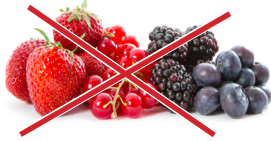
Fruit with skin or seeds