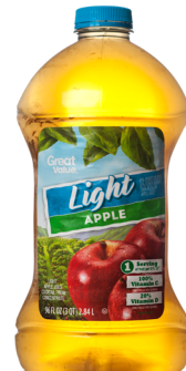
Fruit juices you can see through, such as apple or white grape