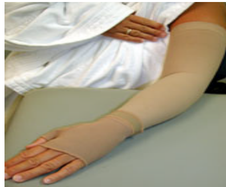
After the sleeve has been put on.