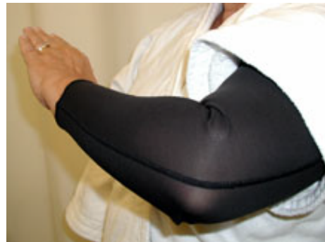
Seam toward the back of the arm.