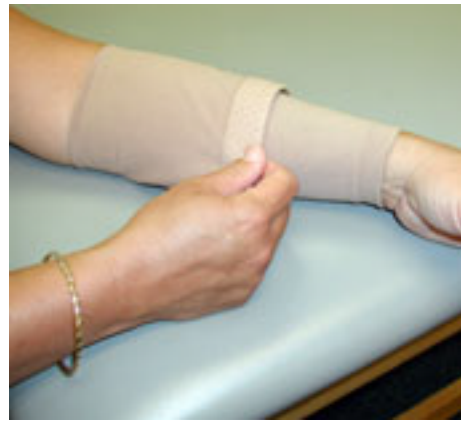
Folded sleeve up to the elbow.