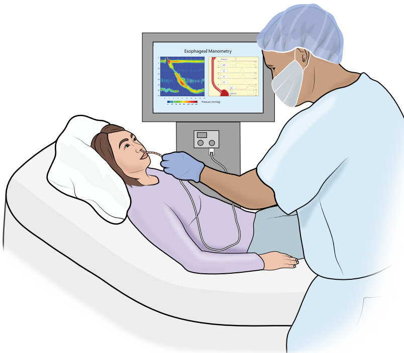
Jaantuska 1: Kateetarka ayaa la geliyaa sanka. Kumbuyuutarka wuxuu diiwaangeliyaa caddaadiska qolqolka hoose ee hunguriga.

Figure 1: The catheter is inserted into the nose. The computer records the pressure of the lower esophageal sphincter.